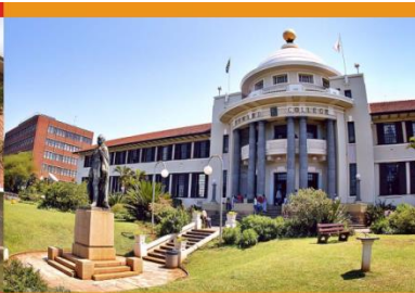
HOWARD COLLEGE CAMPUS